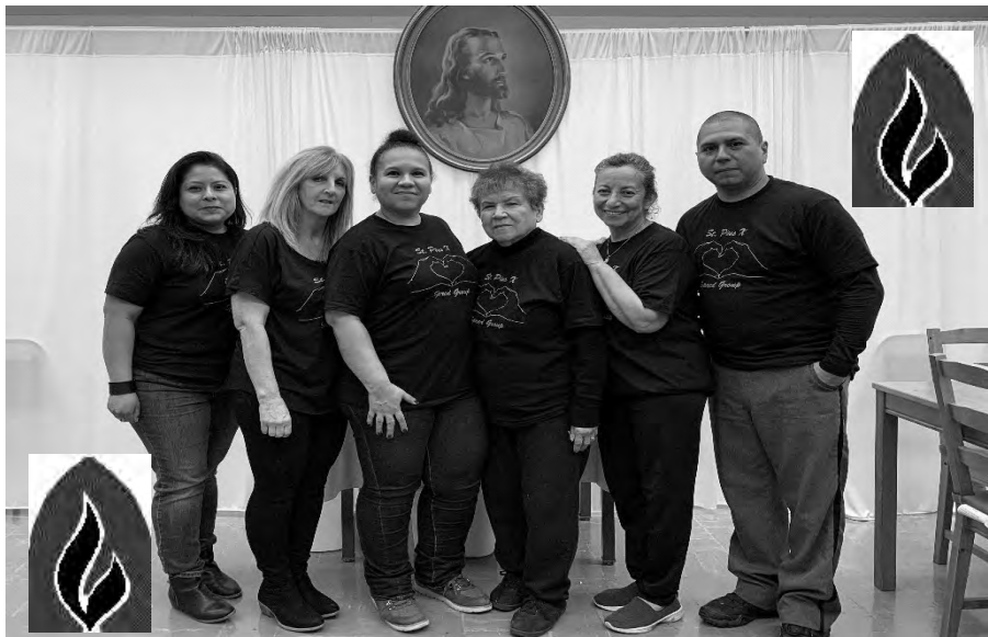
(left to right)

The Catechists of St. Pius X SPRED wish to express their gratitude to all parishioners for their continued support of this wonderful religious development program!