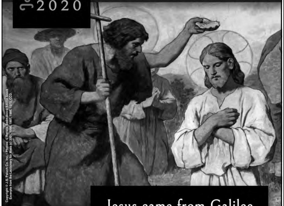
Copyright © J.S. Paluch Co. Inc. - Photos: © Renata Sedmakova/Adobe Stock Excerpted from the Lictionary for Mass (© 2001, 1998, 1997, 1986, 1970, CCB).

Jesus came from Galilee to John at the Jordan to be baptized by him.